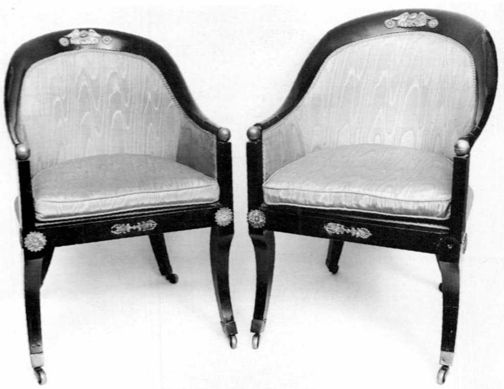
2. Pair of 'Roman' chairs supplied by Cleland & Jack, September 1809

Prior to the identification of the Hunterian pieces the only illustration of the type of furniture produced by Cleland & Jack had been an engraving in R. Chapman's The Stranger's Guide or A Picture of Glasgow , 1812, showing one floor of the firm's retail warehouse in the Trongate. This print (Fig. 6) shows an assortment of items, including sideboard tables, dining room, breakfast and sofa tables, firescreens, dressing glasses and a globe, neatly displayed in a fashionable classical revival setting, which clearly represents just one department of an extensive shop. The sideboard tables, although shorn of some decorative detail in the engraver's realisation, are recognisable as the characteristic 'stage top' type specified in the Glasgow Cabinet Maker's Book of Prices (1809). The view also indicates the firm's method of displaying upholstery goods, floorcoverings and lighting. The selection of curtain draperies decorating the windows, the swags of fringed fabric draped on pins across the central arch, the lengths of 'ingrain' or 'Scotch' carpet and the different hanging and statuary lamps, are all presumably examples of goods for sale. In the text accompanying this unique illustration, Chapman includes a brief reference to Glasgow's cabinet trade.