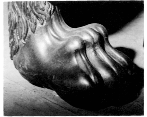
4. Detail of 'lion's paw foot' on circular library table