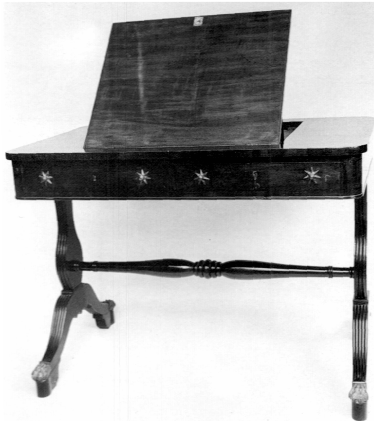
5. One of a pair of 'mahogany writing tables with flaps to rise on top' supplied by Cleland & Jack, September 1809. The ivory Figure 5 can be seen on the right-hand drawer front