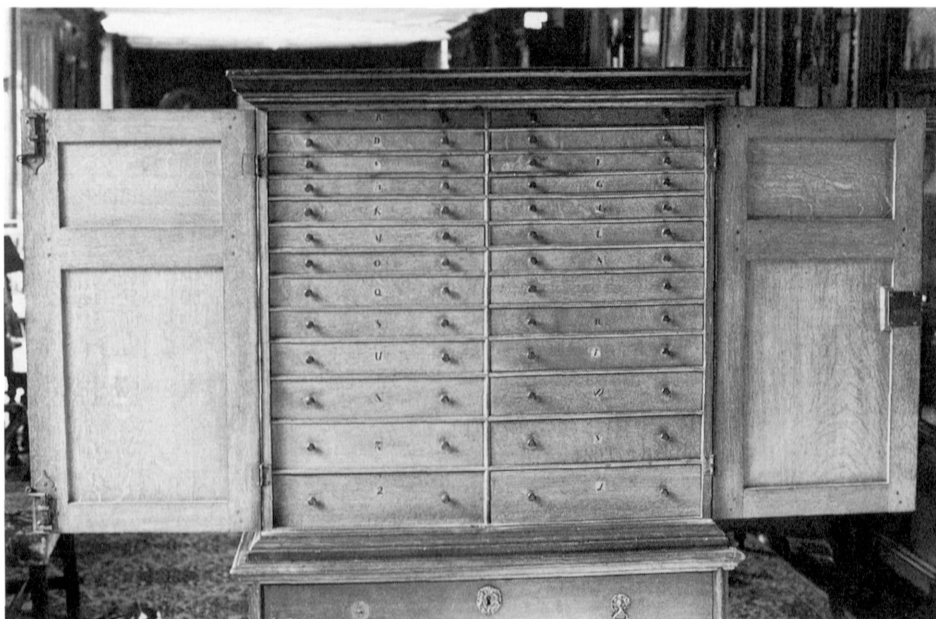
2. The Vigani Cabinet, upper section open