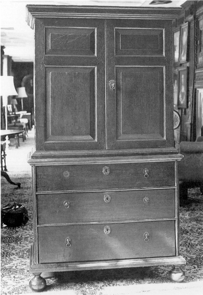
1. The Vigani Cabinet