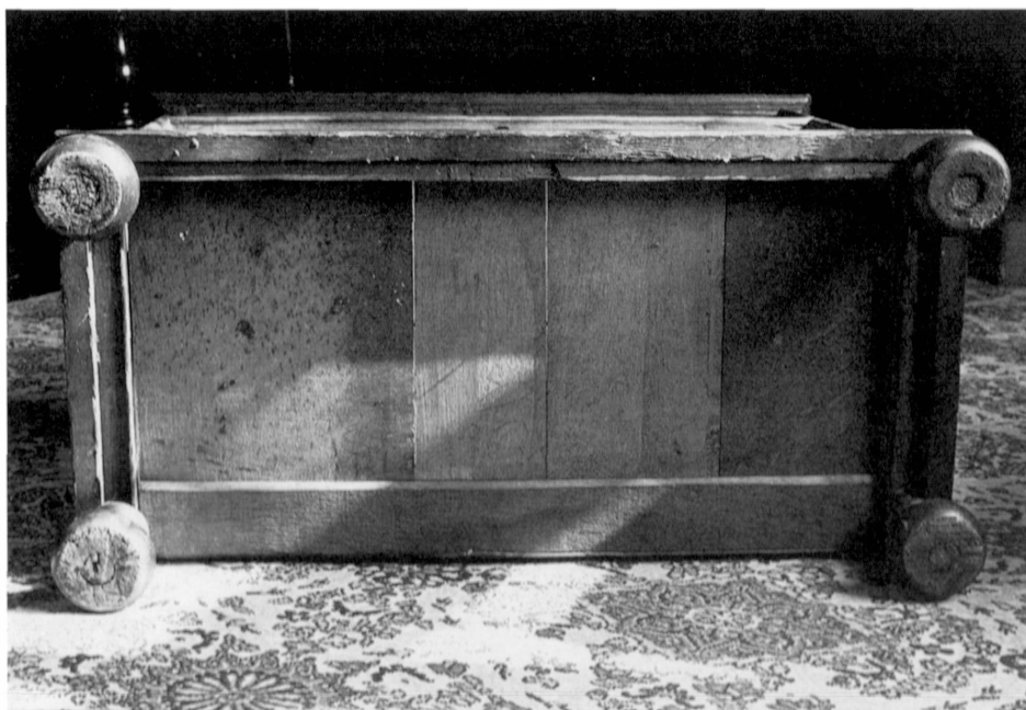
3. Base, showing bun feet dowelled into underframe