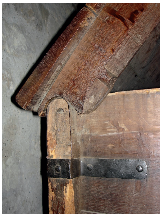
8 Detail of the hinge, Lesser Treaty Chest, 1271–87, oak, Pyx Chamber, Westminster Abbey, London. The authors

assigned the hand to the early sixteenth century. 25 This chest is often referred to as the ‘regalia’ chest today, but there is no specific basis for this, and it is not known whether regalia were kept in this or the Greater Treaty Chest, before the sixteenth century. 26