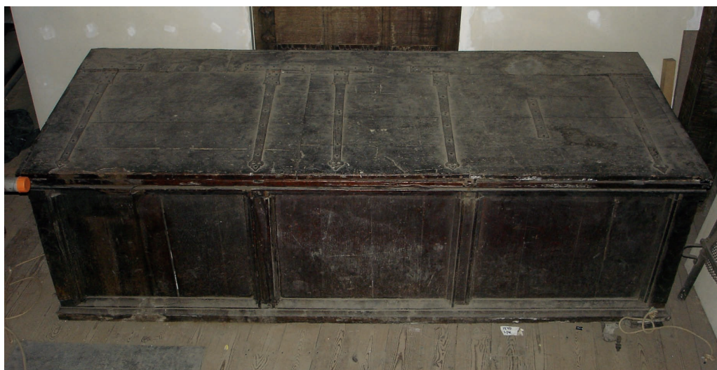
14 Large Panelled Chest, 1405–21, oak, Lapidarium, Westminster Abbey, London. The authors

either of the two trees identified in the sides of the chest, however the last measured ring dates of 1361 and 1367 suggest a construction date of sometime after 1375, but a date not much later than 1400 is most likely.