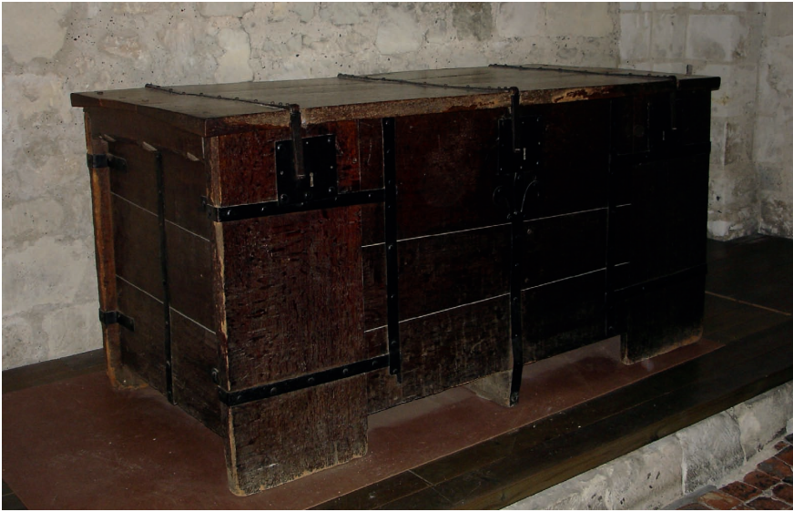
6 Lesser Treaty Chest, 1271–87, oak, Pyx Chamber, Westminster Abbey, London. The authors