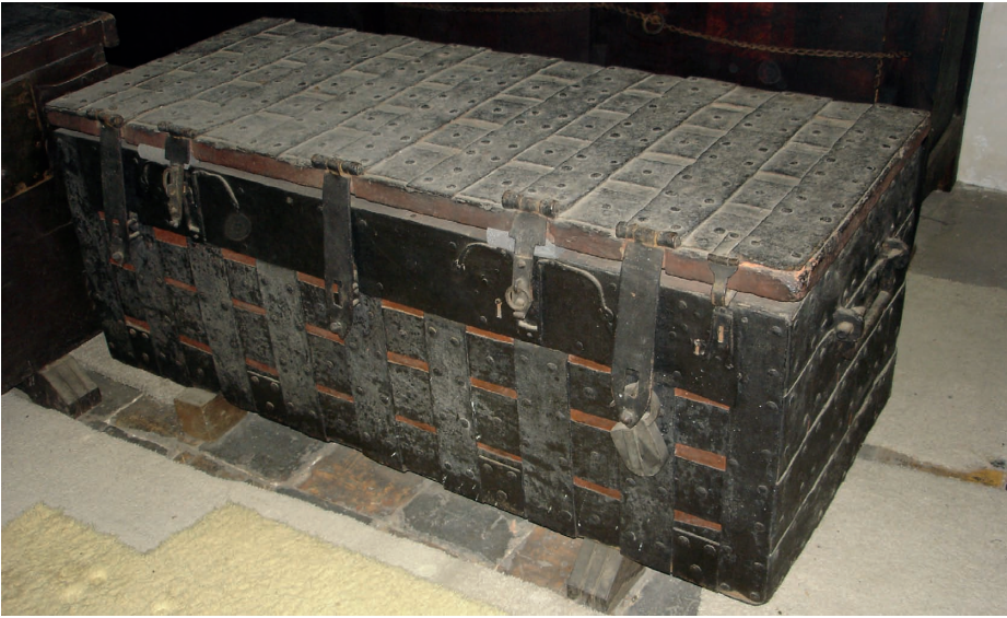
13 Waynflete's Treasure Chest, 1375–1400, oak, Muniment Room, Magdalen College, Oxford. The authors