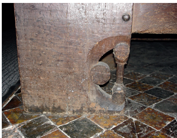
5 (right) Detail of decoration, Long Chest, 1167-99, oak, Muniment Room, Westminster Abbey, London.

treasure. There are three large stiles front and back: the ends measure 14 ins (35 cm) wide and the middle one 18 ins (45 cm). The front stiles have D-shaped indents closed by small columns with Romanesque cushion capitals (Figure 5). A chest in Little Canfield, Essex is much smaller, but of very similar decoration. The front boards were tapered with the widest part at the bottom, but were then hollowed out internally to give parallel faces to the inner face of the plank. They are tenoned into the stiles and set back slightly from the face of the stiles and pegged with a number of pegs with large decorative iron studs nailed over. The end boards were similarly hollowed out internally and were housed in the stiles. The bottom of the chest is made up of two V-jointed tapered boards, the groove having a \frac{1}{4} in. (0.5 cm) round gullet.