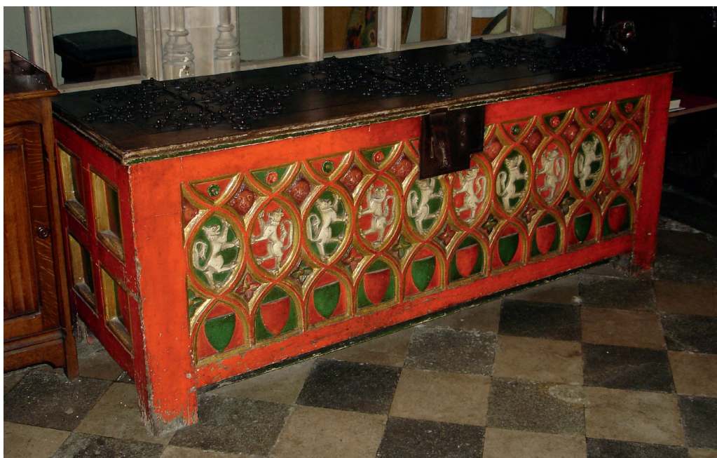
11 Carved chest, 1326–58, oak, choir, Magdalen College chapel, Oxford. The authors

The largest and most elaborately decorated is the one immediately outside the small chantry chapel at the north-east end of the Choir. It consists of a solid front board carved with a series of sunk quatrefoils (Figure 11). This had been previously attributed to the seventeenth century, but dendrochronology has shown it to date from 1326–58, predating the foundation of the College by over a century. The tree-ring dating matched best with local chronologies, giving support to the theory that it might have originated from the original hospital of St John.