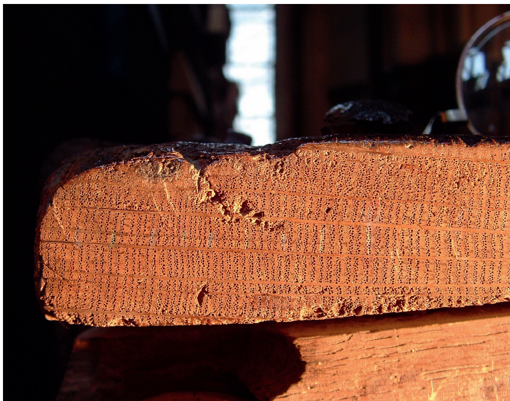
1 Lid of a Westminster Abbey chest showing surface prepared and marked by early dendrochronological investigators. The authors

Report Series also recently detailed work on a number of chests dated at Westminster Abbey, but this cannot be considered to be widely read. 6 Neither can the other main source of dates, Fletcher and Tapper's 'Medieval artefacts' paper of 1984, in which Table 5 is the source of many of the dates given here, but which lacks information on the chests themselves or what the ring series have been dated against. 7