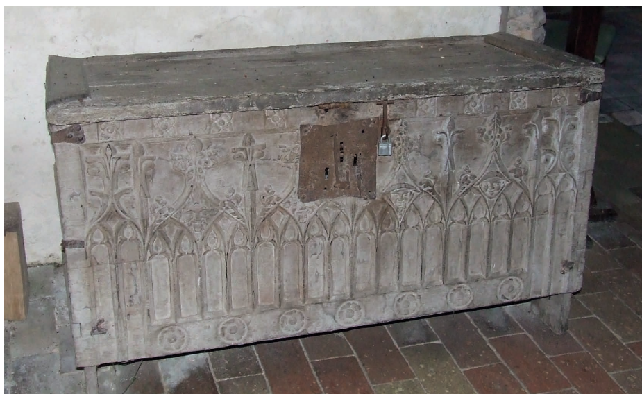
12 Little Waldingfield, third quarter fourteenth century, oak, St Lawrence's Church, Little Waldingfield, Suffolk. The authors

the years 1188–1363. 40 This second board had earlier been dated to 1244–1361. 41 Whilst it is just possible that his dating might relate to the actual date of 1113–1341, if it had been measured from the other end of the board, thereby encountering grain drift, the variation in the number of rings is worrying. Fletcher managed to get a much better result from his analysis of this chest, however. His results on the analysis of the four lid boards and four stiles were published in detail, including the number of rings and the dates they spanned. 42 Unfortunately, only two of his punch-card datasets were found: that for the front left stile, which spanned the years 1180–1362, compared to his published dates of 1156–1361, and the front right stile, which spanned the years 1146–1365, compared to his published dates of 1133–1360. These do not exactly coincide, but what is not known is whether the punch cards were older versions, or newer ones which had additional measured rings. Although it was not possible to conclusively confirm the dating of these sequences, they are certainly very close indeed, and the felling date range of 1390–1400 is not too far out from the 1379–95 date range produced from the 2008 analysis.