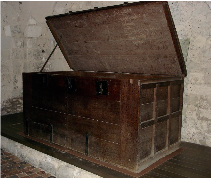
7 Greater Treaty Chest, 1379–95, oak, Pyx Chamber, Westminster Abbey, London. The authors