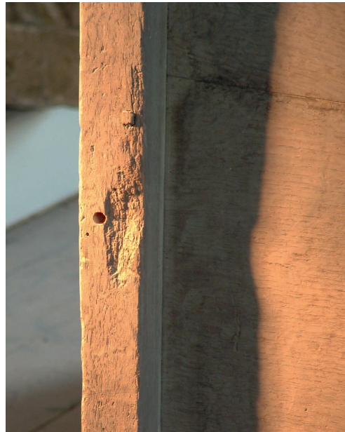
2 (left) Micro-boring the Mendlesham I pine chest. The authors