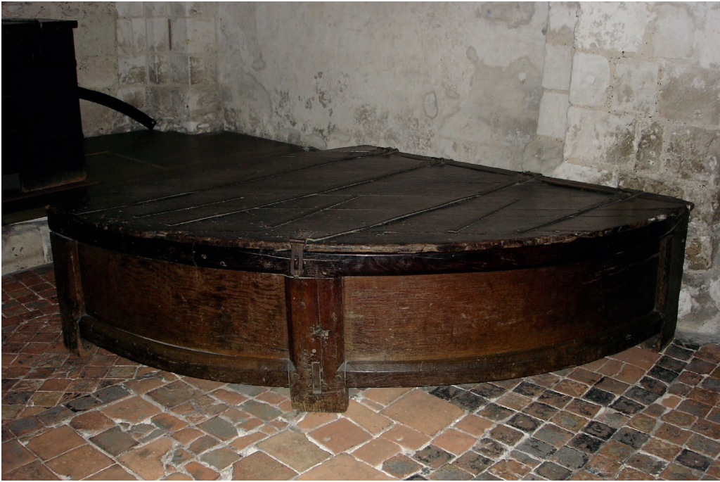
9 Cope Chest, 1375–1400, oak, Westminster Abbey, London. The authors