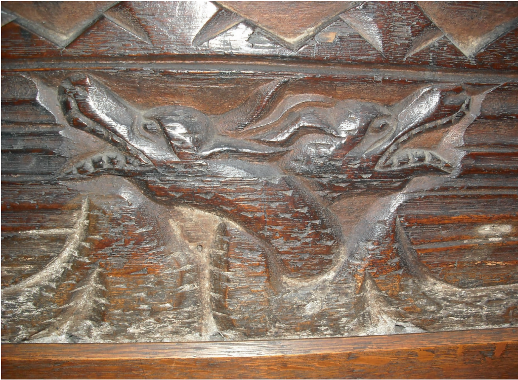
10 Carved heads from the Prittlewell boards, early-/mid- fourteenth century, oak, St Mary's Church, Prittlewell, Essex. The authors

retained and framed to be hung as decorative features. The two panels are quite different in their subject matter and style of carving — one consisting of two entwined dragons heads with elongated wings (Figure 10) is in a 'chunky', almost primitive style, with large, almost crude, triangle and diamond decoration; the other has finely carved tracery resembling complex masonry patterns.