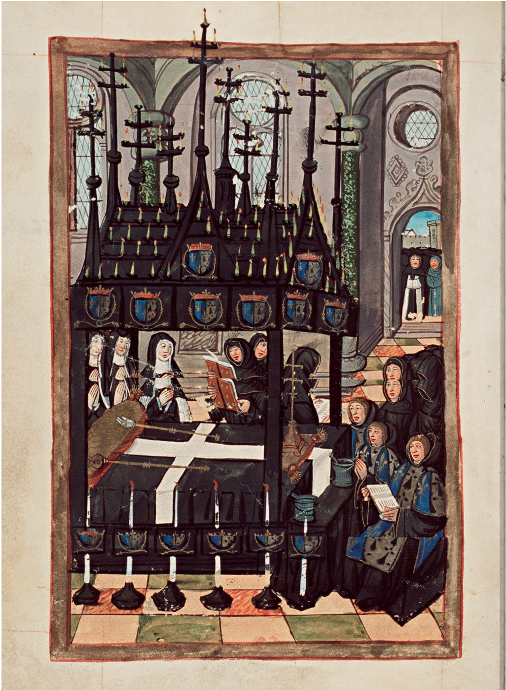
4 Commémoration de la mort d'Anne, reine de France, duchesse de Bretagne, c. 1515. Museum Meermano MMW, 10 C 12 fol. 24v