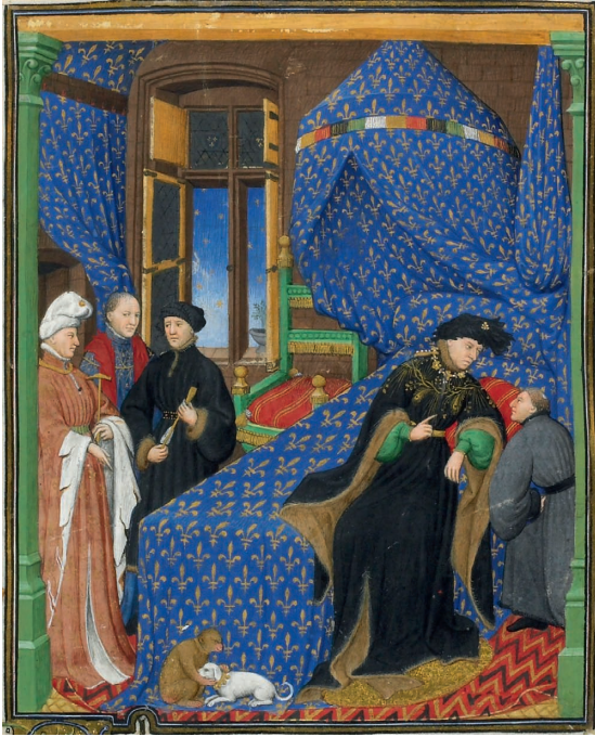
1 Lit parement : a ‘sperver’ with a corona over a bed without a tester or celour. Bibliothèque de Genève , MS Fr. 165 fol. 4, Charles VI and Pierre Salmon, c. 1415

Several sixteenth-century Scottish inventories mention ‘chapel beds’. A chapel bed was constructed at Dunfermline palace in November 1600 for Anne of Denmark prior to the birth of Charles I. This article proposes that these were beds provided with a suspended canopy with curtains which would surround any celour or tester (Figure 1).