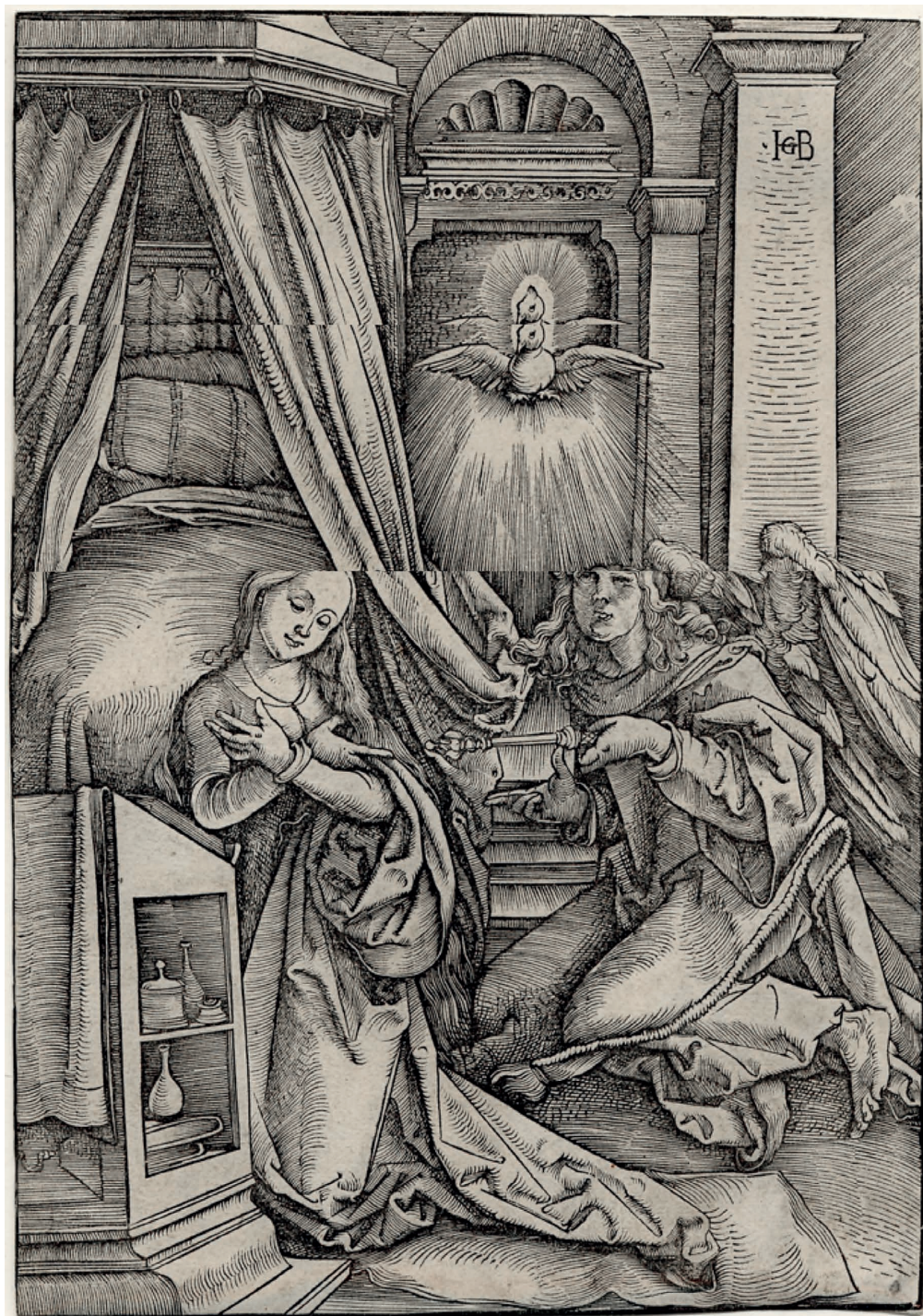
2 Annunciation , Hans Baldung Grein, c. 1515. The British Museum