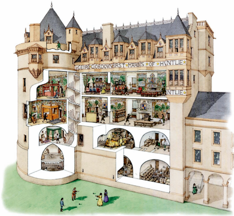
7 Huntly Castle, from the 1648 inventory. Historic Scotland/Picture, Stephen Conlin

Ane chappell bed with ane imbroyddied rooffe, ane pand and headpiece of yellow floured velvet imbroyddied with gold, and fyve piece of damask rid and yellow courtines, with a freinzie of silk and gold and laid with gold laice, six gilted knappes with feathers and spaingles, a stitched taffitie matt. 37