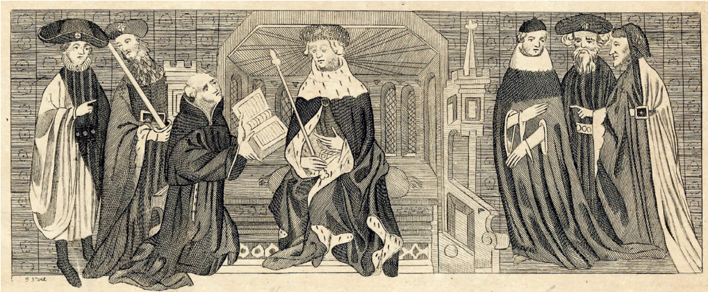
6 Hoccleve and Henry IV with hexagonal canopy, engraving after manuscript illumination. The British Museum

A canopy sculpture at Linlithgow is usefully suggestive with an angel in a nimbus holding two drapes above, which were originally painted with lettering to compliment the statue of the Pope beneath. The hexaform umbrella canopy is of course seen in the sperver employed as the heraldic badge of the Worshipful Company of Upholders of London, dating from 1465 in the reign of Edward IV, so-called in a grant of the arms of 1634. 30