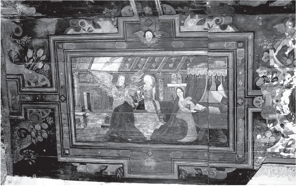
3 Annunciation c. 1626, detail of painted vault at Provost Skene's House Aberdeen. Royal Commission on the Ancient and Historical Monuments of Scotland

an angel in an ordinance of Edward IV, a term recycled in the seventeenth century during the second flowering of the hung bed. 3 An enclosing canopy for a bed might also be called a traverse . One bed with a counterpoint embroidered with the Scottish royal arms at Hampton Court in 1548, perhaps looted from Holyroodhouse during Lord Hertford's raid on Edinburgh in May 1544, had a tester with a tent;