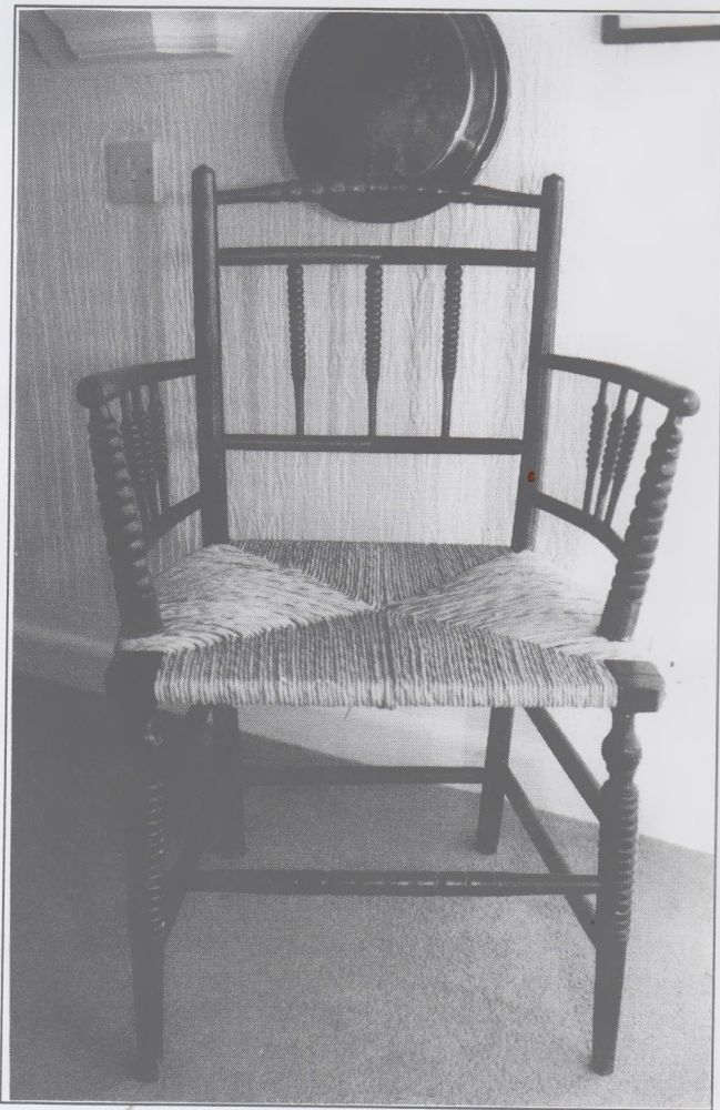
Fig. 7 A vernacular antecedent?