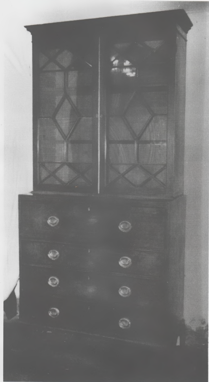
Fig. 6 A recent acquisition by Carmarthen Country Museum