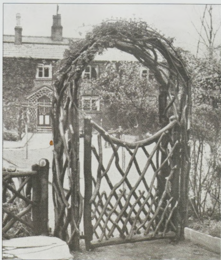
Fig 2 Arched gateway