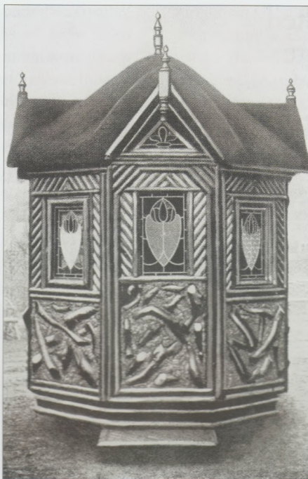
Fig 1 Summerhouse

'We beg respectfully to call attention to our DESIGNS AND PRICES OF GARDEN FURNITURE, etc. We think it unnecessary to say much as to the QUALITY AND WORKMANSHIP of any article we manufacture, as we are well known throughout the United Kingdom. Suffice to say that, for elegance of design and durability, they are excelled by none. All goods are