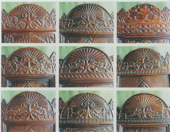
Fig. 2 Selection of crest rails from Co. Durham chairs, second half of the 17th century