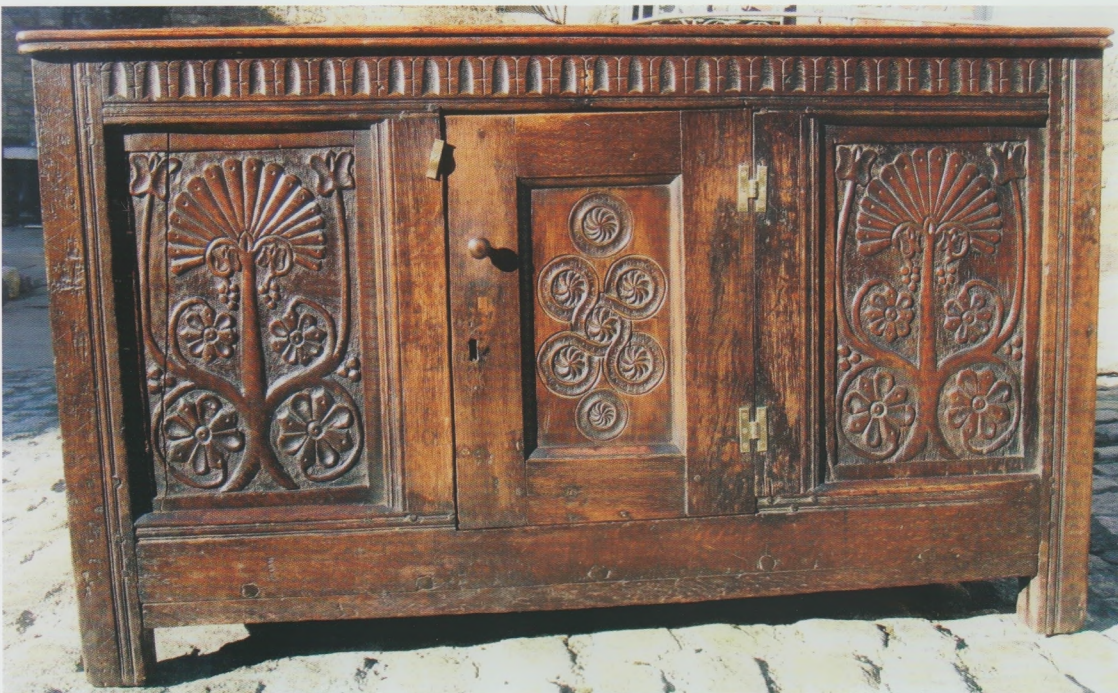
Fig. 1 Joined oak chest, second half of the 17th century, Co. Durham. The centre panel has been made into a door