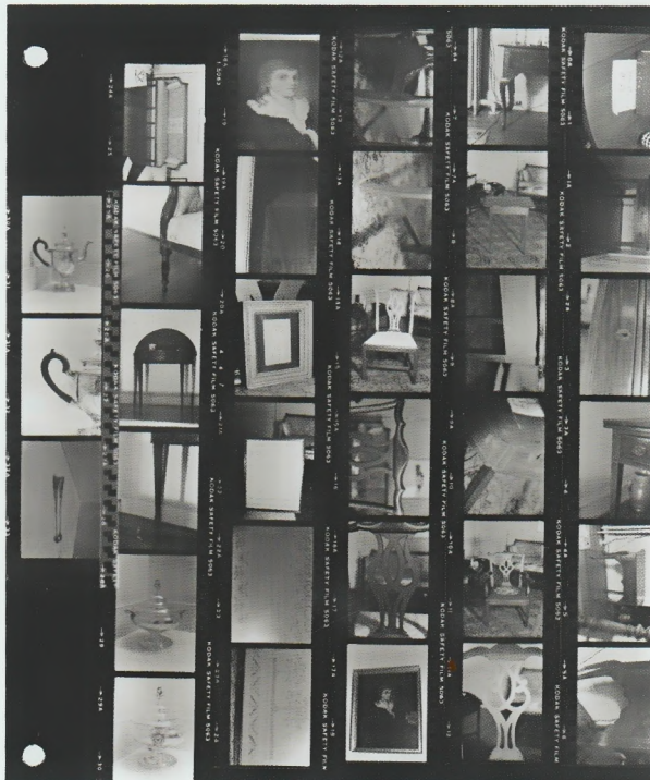
An example of a contact sheet from the MESDA Field Research Program