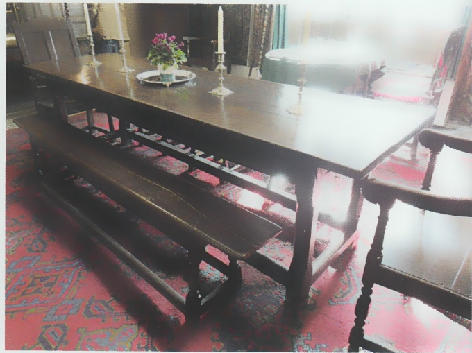
Westwood Manor, Wiltshire (National Trust). The hall table board and frame arranged with an armchair at each end, a long bench along one side and three joint stools along the other. In the window bay are a small gateleg table and a splat-back chair with an exaggerated crest rail.