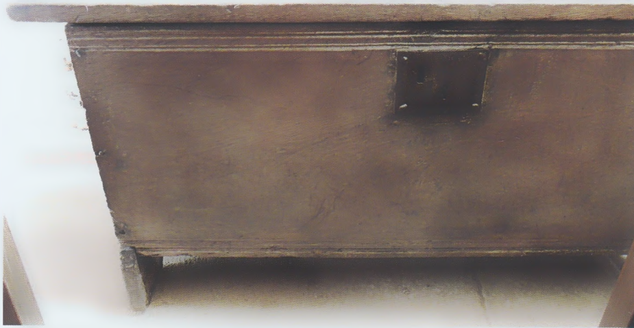
St Mary's church, Westwood, Wiltshire. Seventeenth-century (?) chest with shallow mouldings, handmade nails and a simple keyplate.