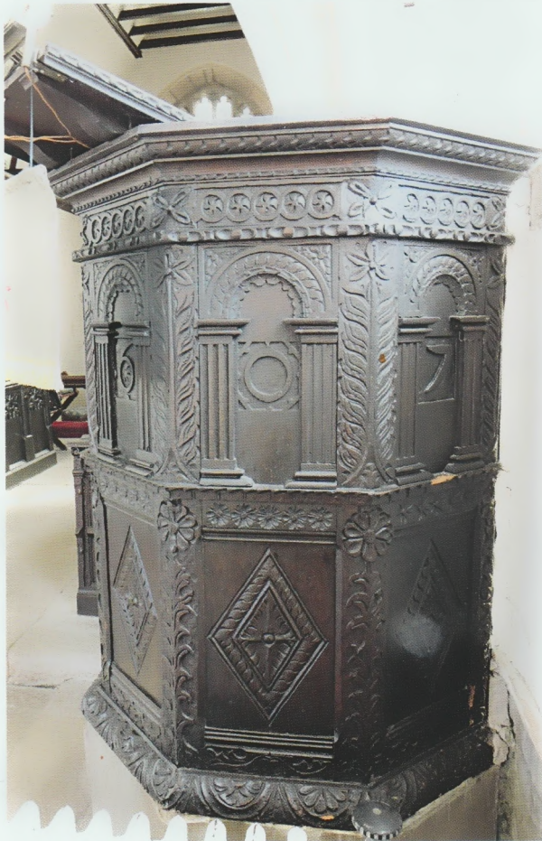
St Mary's church, Westwood, Wiltshire. The pulpit has the date 1607 in the upper band of arches, one numeral per panel, with carved lozenges in the lower tier and elaborate foliage carving on the angled corner stiles, different in each tier.

On a fine sunny morning ten RFS members assembled at Westwood Manor, Wiltshire, many of us arriving in time to first visit St Mary's church next door. The treasures there include medieval choir stalls, a beautiful carved and panelled ceiling in the Lady Chapel and a late-medieval ogee font cover with crocketed ribs and a foliate finial. Dating from the seventeenth century are the pulpit, which the church guidebook says came originally from Norton St Philip, and the low chancel screen, with elaborate pierced panels consisting of a large oval with carved roses in each open spandrel. Four turned finials project into each oval. The top rail has pierced rectangular panels below a band of dentils. Various features suggest it has been cut down from former altar rails as the mouldings are not complete around the main panels and one of the pillars is now asymmetrical and clearly incomplete. A fine wooden eagle lectern is of unknown date and provenance.