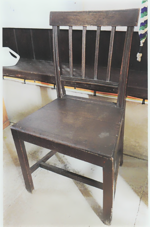
St Mary's church, Westwood, Wiltshire. 'Country Sheraton' chair in the entrance through the base of the tower. It has a much deeper top rail than the chairs featured in NL76, and has shallow mouldings on all the elements of the back above the seat.